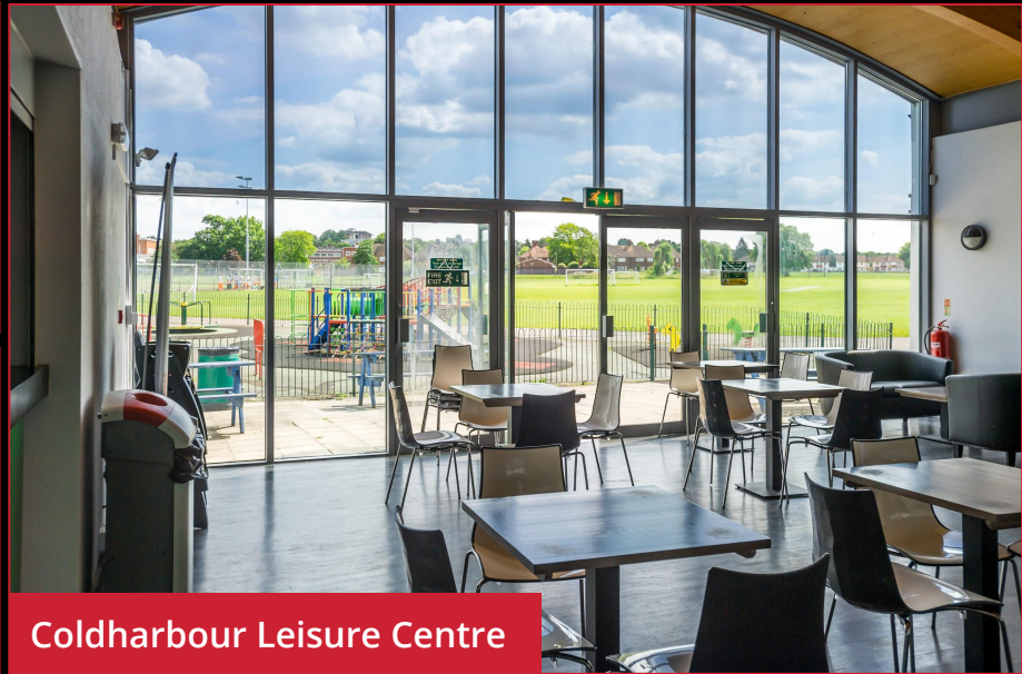
Coldharbour Leisure Centre