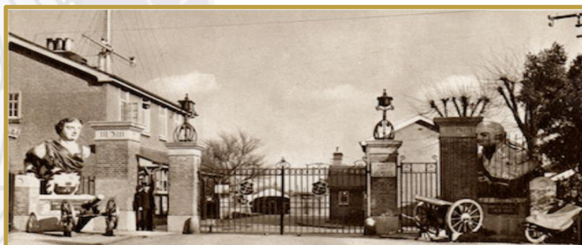
Ganges 1905 - 1976