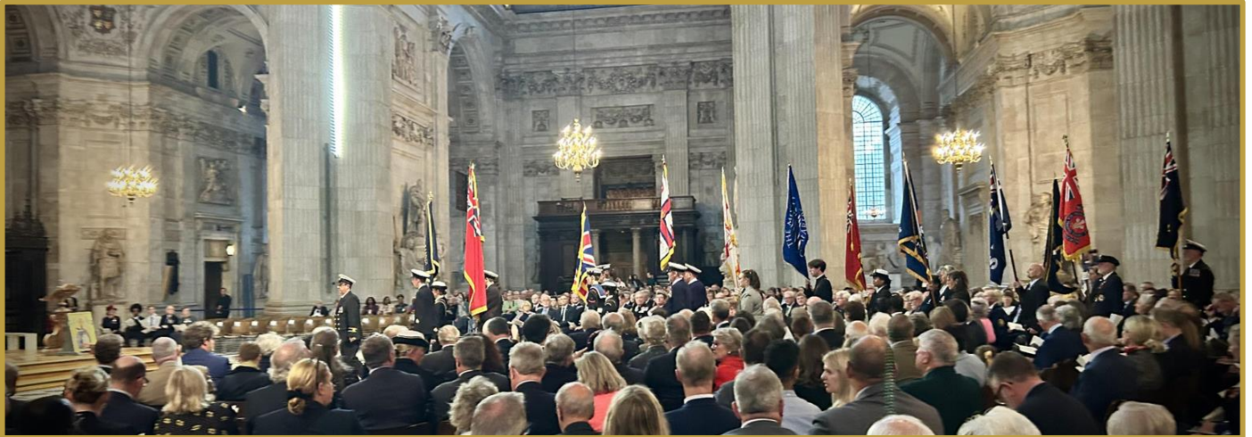
The Colour party procession into the Cathedral at the start of the service.